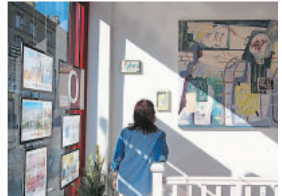
A property seeker studies the exhibits in the Estate Agency